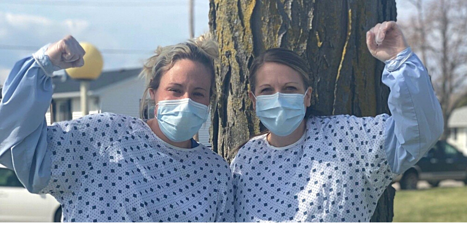
Caregivers at Emerald Nursing Facility in Cozad, via Nebraska Heallth Care Foundation.