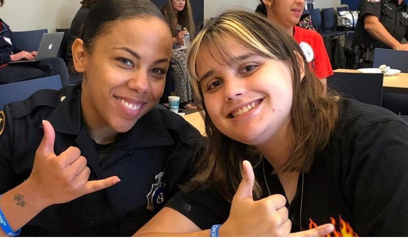
Participants at the national Be Safe training event, hosted by Autism Action Partnership.